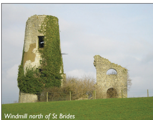
Windmill north of St Brides