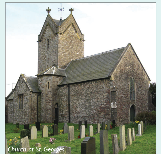
Church at St. Georges

Distance: 9 miles, shorter options 4 3 / 4 and 6 1 / 2 miles.