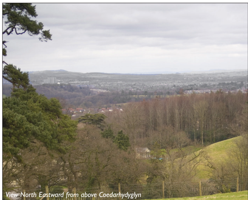
View North Eastward from above Coedarhydyglyn

START - The Walk commentary starts on the road that leads from St Fagans village to the Museum car park, but the walk can equally well be started at Peterston or St Brides Super Ely.