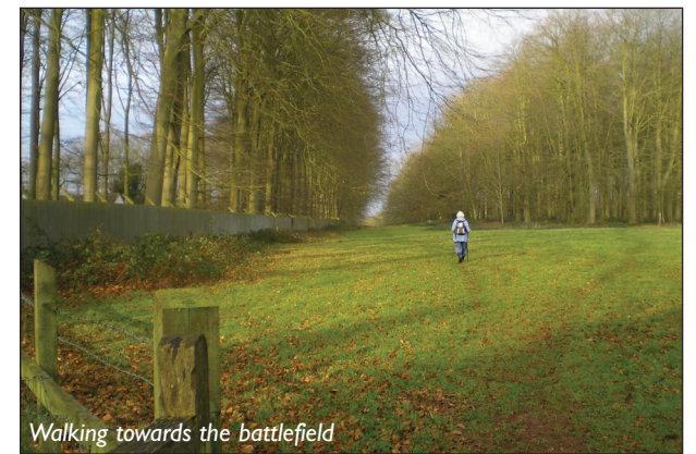
Walking towards the battlefield