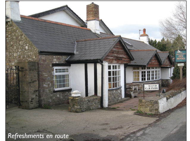
Refreshments en route