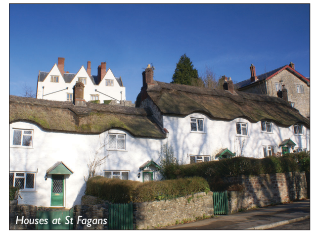
Houses at St Fagans

Registered Charity No. 1062031 Registered Company No. 3330088