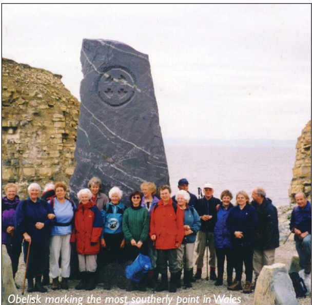
Obelisk marking the most southerly point in Wales