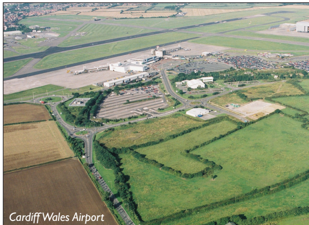
Cardiff Wales Airport