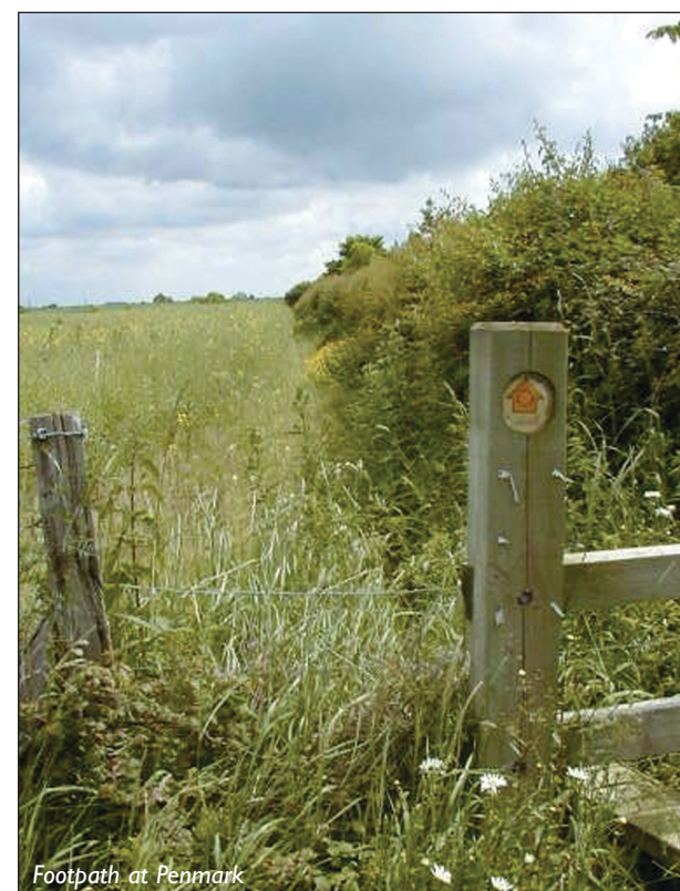
Footpath at Penmark

Valeways has published a guide to the Millennium Heritage Trail. This colourful book describes the 16 sections which make up the Trail and comes in a package with 16 separate A3 maps. The guide can be obtained from Valeways for £8.49 including post and packing.