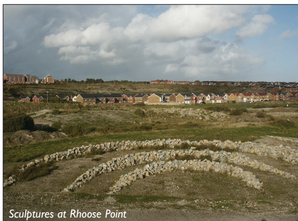
Sculptures at Rhoose Point