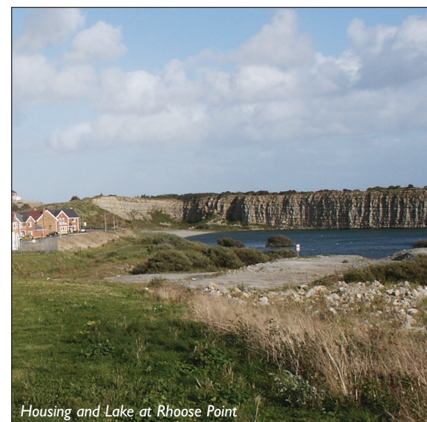
Housing and Lake at Rhoose Point