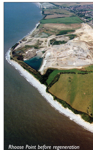
Rhoose Point before regeneration

Turn right noting the pub, church and castle ruins en route 5. Continue on the main road (ignore road entering from right and later, road from left) to reach a point