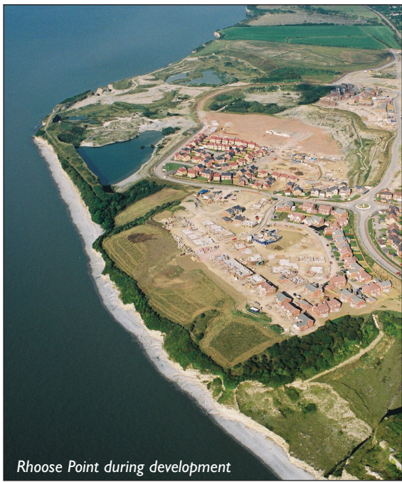
Rhoose Point during development