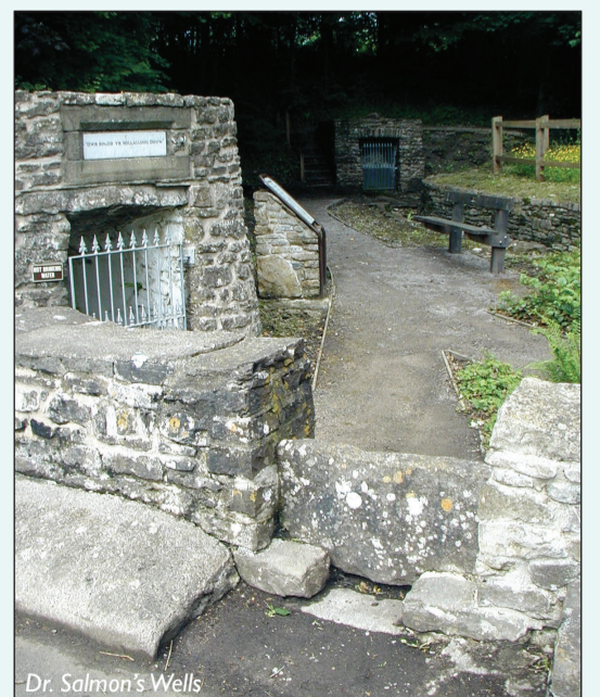
Dr. Salmon's Wells

Distance: 8 miles. Shorter option 3 1/2 miles