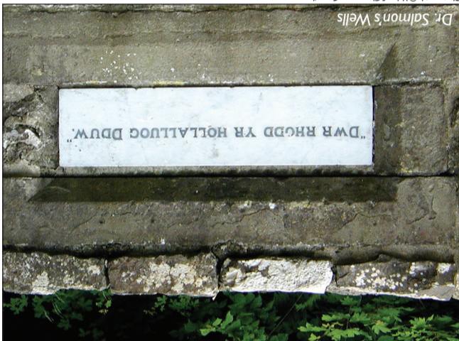
Dr. Salmon's Wells

Valeways has published a guide to the Millennium Heritage Trail. This colourful book describes the 16 sections which make up the Trail and comes in a package with 16 separate A3 maps. Information on purchasing the guide can be obtained by contacting Valeways.