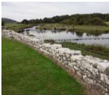
Venturing just into Bridgend to the Merthyr Mawr bank of the River Ogmore.