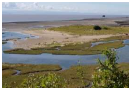
South to the coast at Ogmore.

The Walking Festival steering group were so excited about the positive response this year that they have already planned the dates for the 2023 festival: