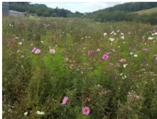
East to Penarth with the Joseph Parry walk.