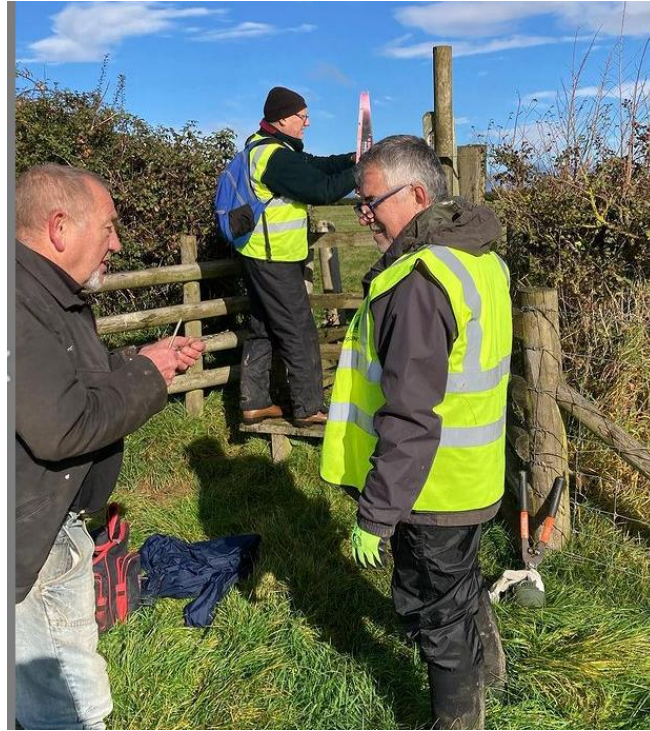
20 October 2020 – Llancarfan. Revealing 2 hidden kissing gates and partial clearance of a section of footpath